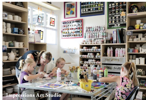
Impressions Art Studio