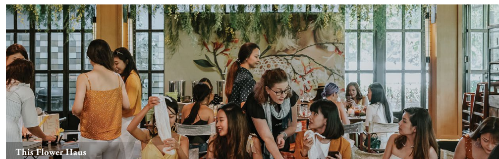
This Flower Haus

WHERE Blk 9A Dempsey Road, S(247698) CONTACT 9188 1247