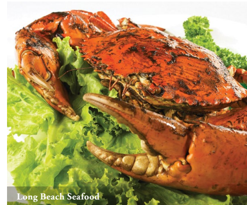
Long Beach Seafood

For seafood lovers, you don't want to miss the Black Pepper Crab at Long Beach Seafood . Created in 1982, the fragrant pepper sauce dish is a local classic and has been a popular choice among both locals and tourists alike. If you prefer Chilli Crab, head to JUMBO Seafood , where you can enjoy the sweet and savoury crab dish with Mantou, a crispy traditional Chinese bun.