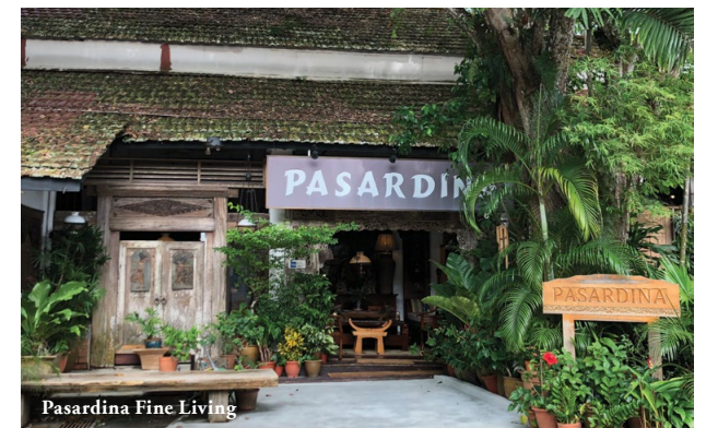
Pasardina Fine Living

WHERE Blk 13 Dempsey Road, #01-01, S(249674) CONTACT 6472 0228