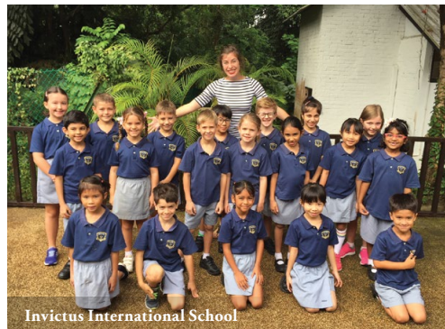
Invictus International School

When it comes to family-friendly destinations, Dempsey Hill is hard to beat. There are play centres and kid-friendly restaurants, but it's not just fun, fun, fun. We check out some of the great education and enrichment centres in the Loewen by Dempsey cluster.