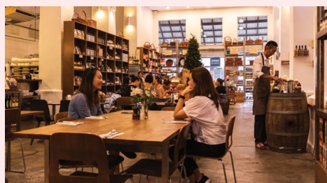
Block 9 of Dempsey Hill