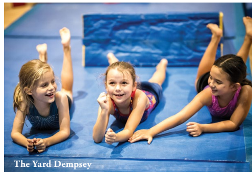
The Yard Dempsey