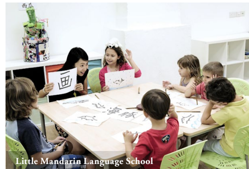
Little Mandarin Language School