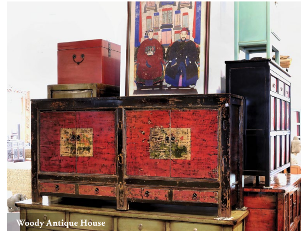
Woody Antique House

WHERE Blk 13 Dempsey Road, #01-05, S(249674) CONTACT 6471 1770